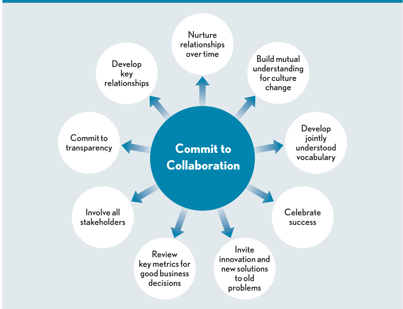
Exhibit 9. Organizational strategies for promoting interprofessional collaboration

Purposeful collaboration among clinicians, health care administration and finance leaders is the key to delivering high-value health care.