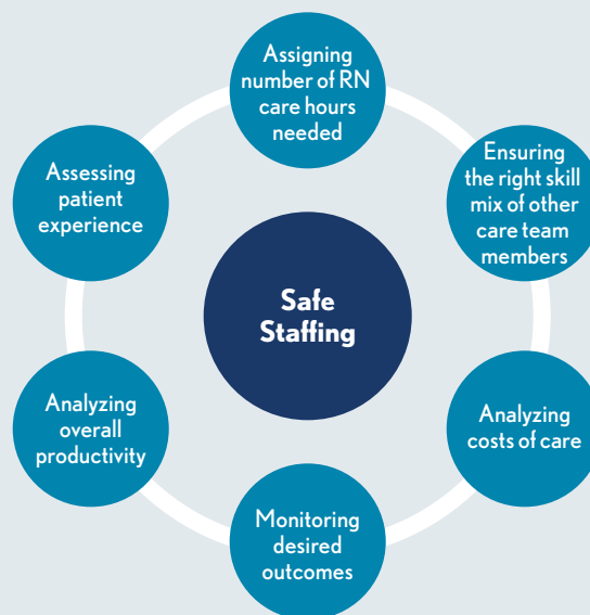
Exhibit 1. What is safe staffing?

It is important to note that nurses at every level, including staff nurses, routinely make decisions that can impact the organization's financial health. For example, being aware of the issue of patient supply waste and making an effort to reduce it advances key organizational and systemic waste reduction goals. 5 Staff nurses are also keenly aware of the need to anticipate and plan for patient and family transitions in care that affect hospital length of stay, post-hospital resources and patient education to increase adherence to discharge instructions and follow-up care, all of which can have significant impact on finances. Also, nursing care is a key contributor to the patient experience. As such, the quality of the nurse work environment is strongly associated with patient satisfaction as measured by the Hospital Consumer Assessment of Hospital Providers and Systems Survey (HCAHPS), in particular