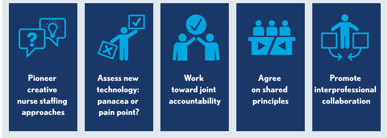
Exhibit 7. A systematic approach to improving allocation of nursing resources

Perception versus reality in nurse staffing. There is a perception that nursing has not identified viable alternatives for implementing data-driven staffing and scheduling. The reality is simply that care must be matched to patient needs and that those who deliver that care vary in their education, skill, experience and scope of practice. Therefore, flexibility is essential, and the nurse must have the decision-making latitude to address changing patient needs. In the absence of alternative methods, there is a strong tendency to revert to traditional methods to derive staffing budgets, which in the eyes of nurses, fail to recognize essential elements of nurse and patient characteristics.